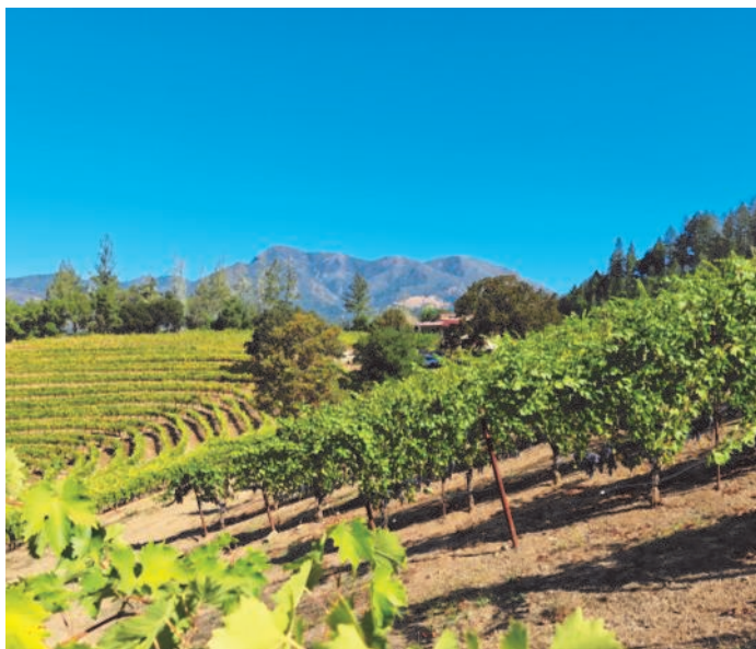
A view of Mt. St. Helena from the Sangiovese vines in Knights Valley